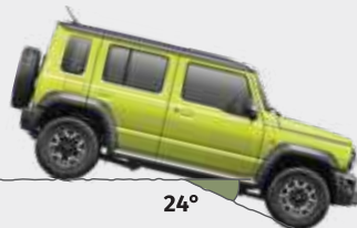
RAMP BREAKOVER ANGLE