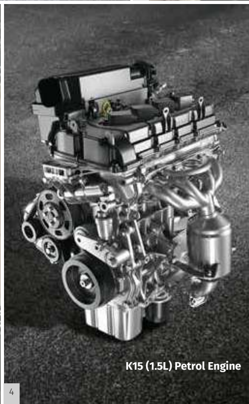
K15 (1.5L) Petrol Engine