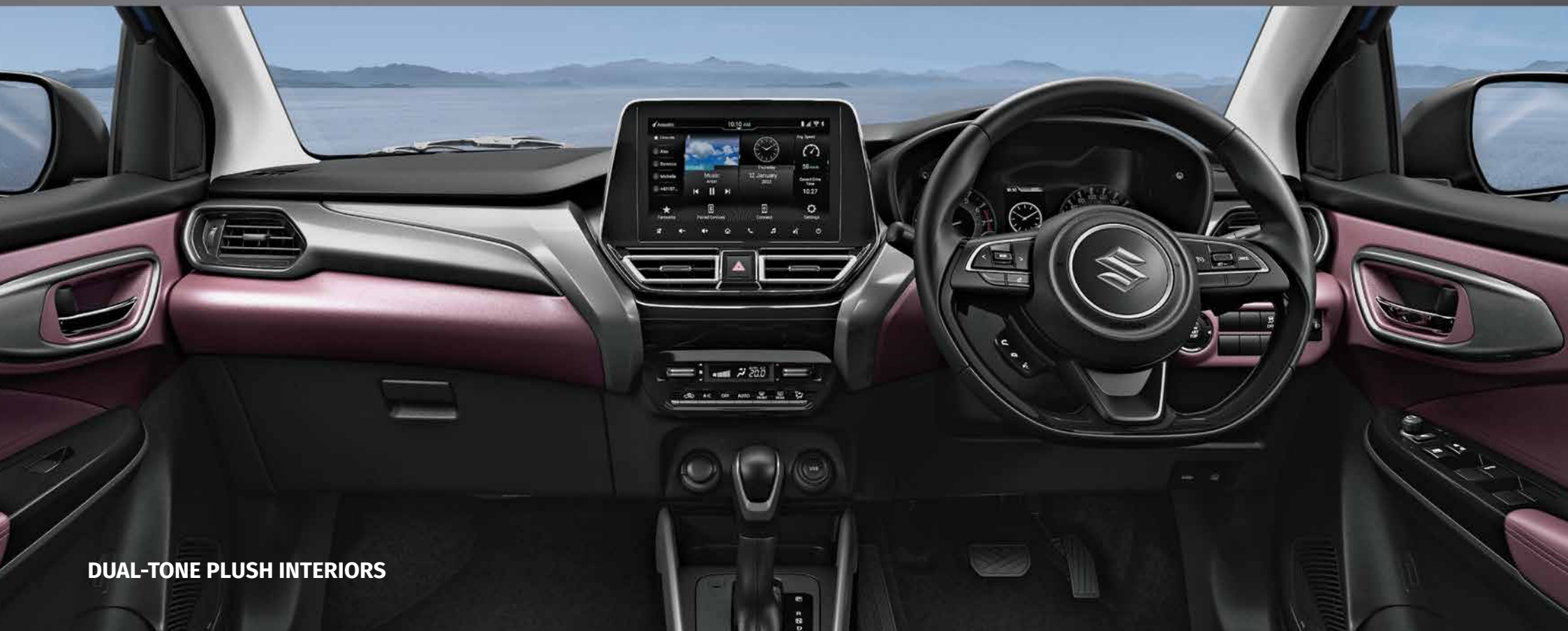
DUAL-TONE PLUSH INTERIORS

From the moment you step in, FRONX enhances the SUV experience with its structural precision and integrated function. The dual-tone dashboard with special forged metal finish and accents seamlessly connects the steering, infotainment system and rounds off the interiors in style. Cruise control and steering-mounted controls ensure you never have to take your hands off the wheel. What amps up the luxury for you, and yours, are details like the driver armrest; rear AC vents; and rear fast charging.