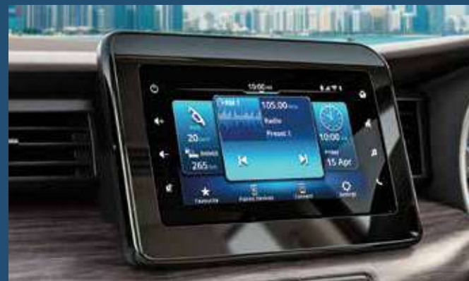
17.78cm Smartplay Pro Connect with your world with just a voice command - "Hi Suzuki".