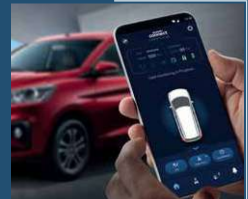
Connected Car Technology with Suzuki Connect Always stay connected with your car.