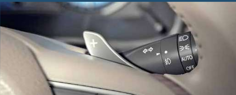
6-Speed AT with Paddle Shifters Surge ahead by engaging the smart paddle shifters.

● Togetherness, driven by technology. The Ertiga is equipped with state-of-the-art technology to add more fun to your moments of togetherness.