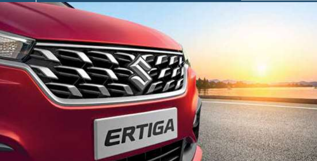
Dynamic Chrome Winged Front Grille The most stylish way to make an entrance.

● Elegant from every angle, the Ertiga is designed to bring out the stylish side of togetherness.