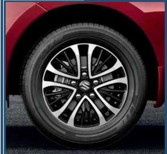
Machined Two-Tone Alloy Wheels Make a statement, every time.