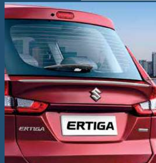
New Back Door Garnish with Chrome Insert Let those second looks chase you.