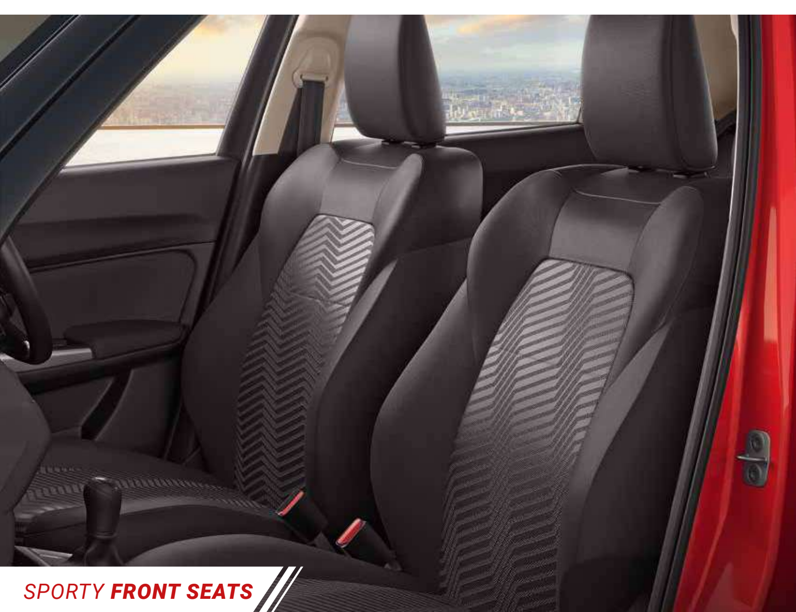
SPORTY FRONT SEATS