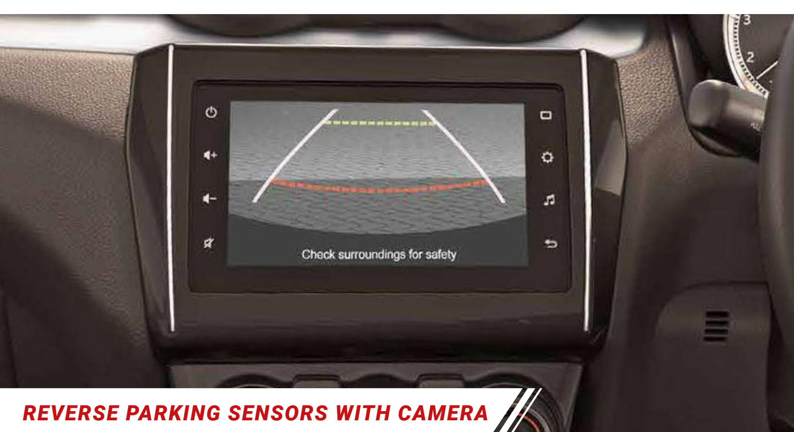
REVERSE PARKING SENSORS WITH CAMERA