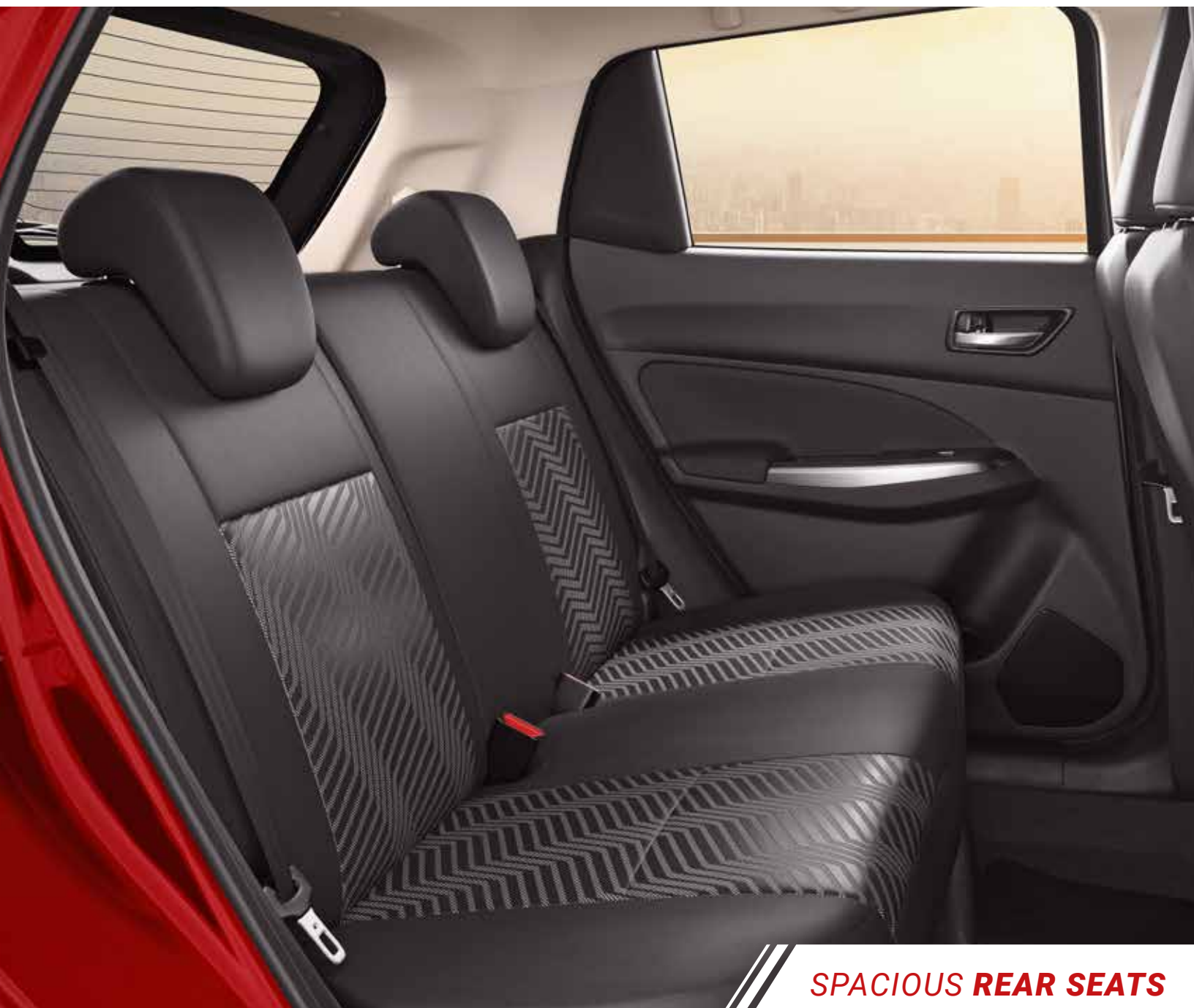
SPACIOUS REAR SEATS