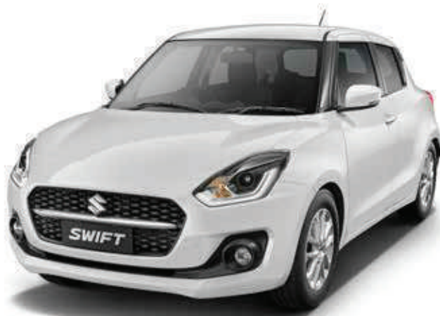
PEARL ARCTIC WHITE