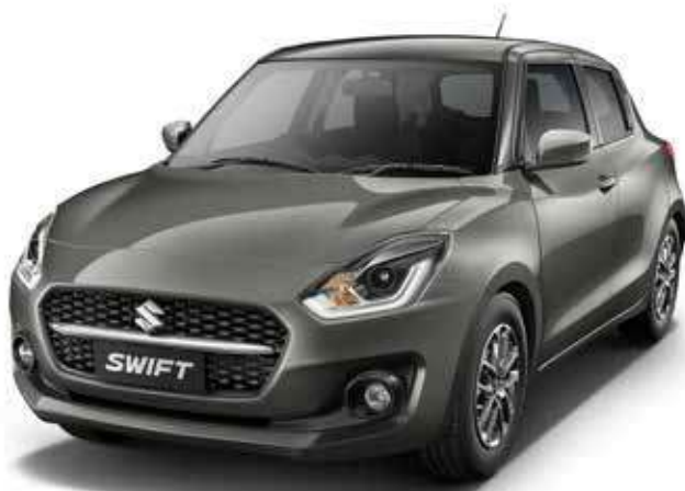
/// METALLIC MAGMA GREY