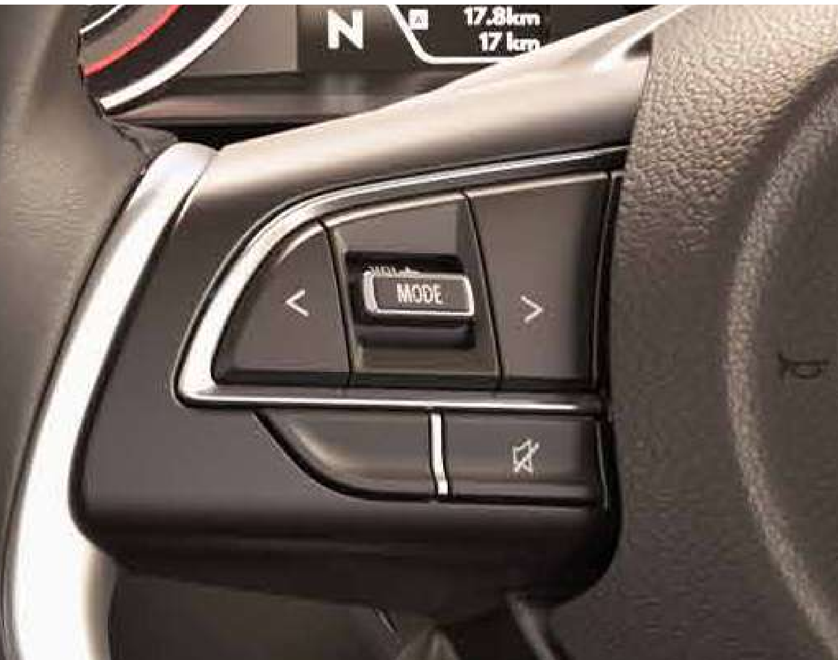
STEERING MOUNTED CONTROLS