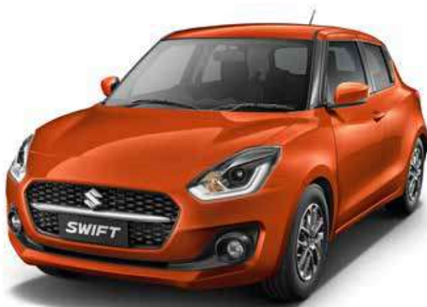
/// PEARL METALLIC LUCENT ORANGE