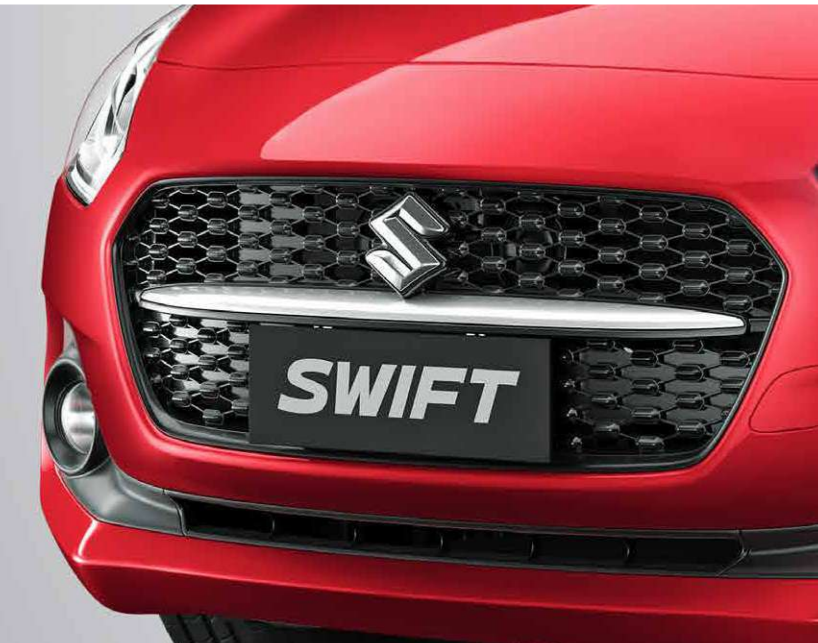
SPORTY CROSS MESH GRILLE WITH BOLD CHROME ACCENT