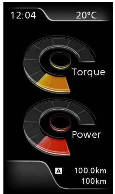
POWER & TORQUE