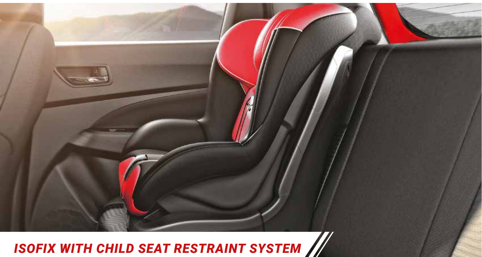
ISOFIX WITH CHILD SEAT RESTRAINT SYSTEM