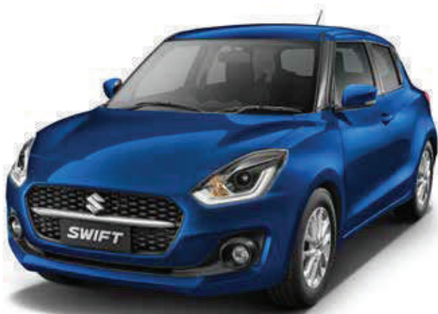
PEARL METALLIC MIDNIGHT BLUE