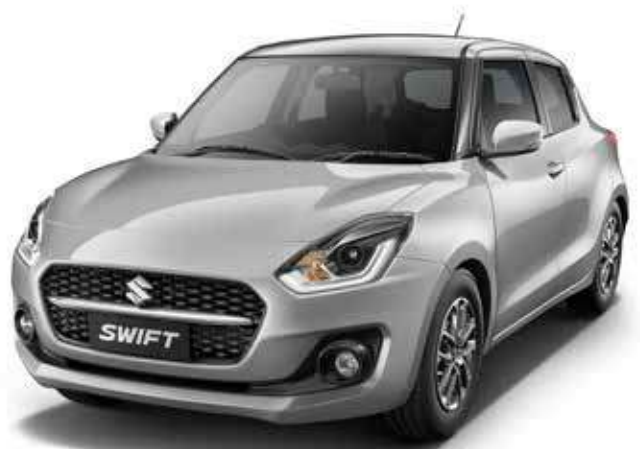
/// METALLIC SILKY SILVER