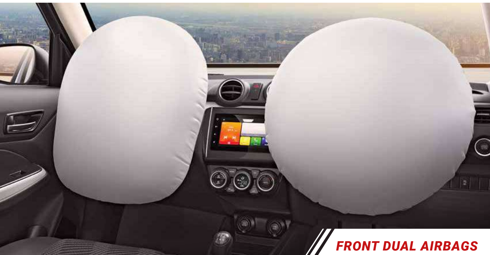
FRONT DUAL AIRBAGS