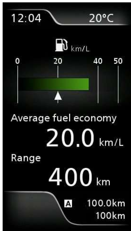
AVERAGE FUEL ECONOMY