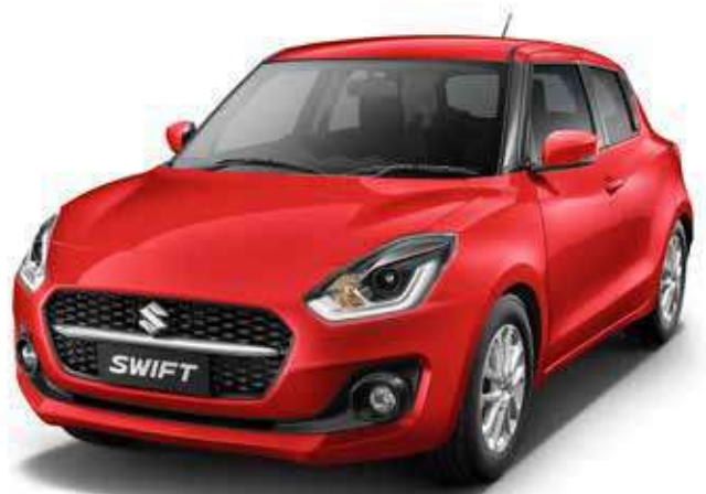
/// SOLID FIRE RED