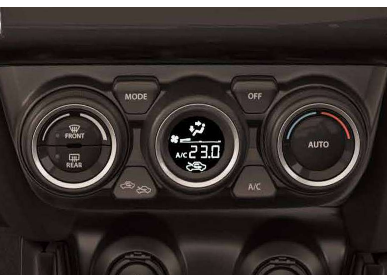
AUTOMATIC CLIMATE CONTROL