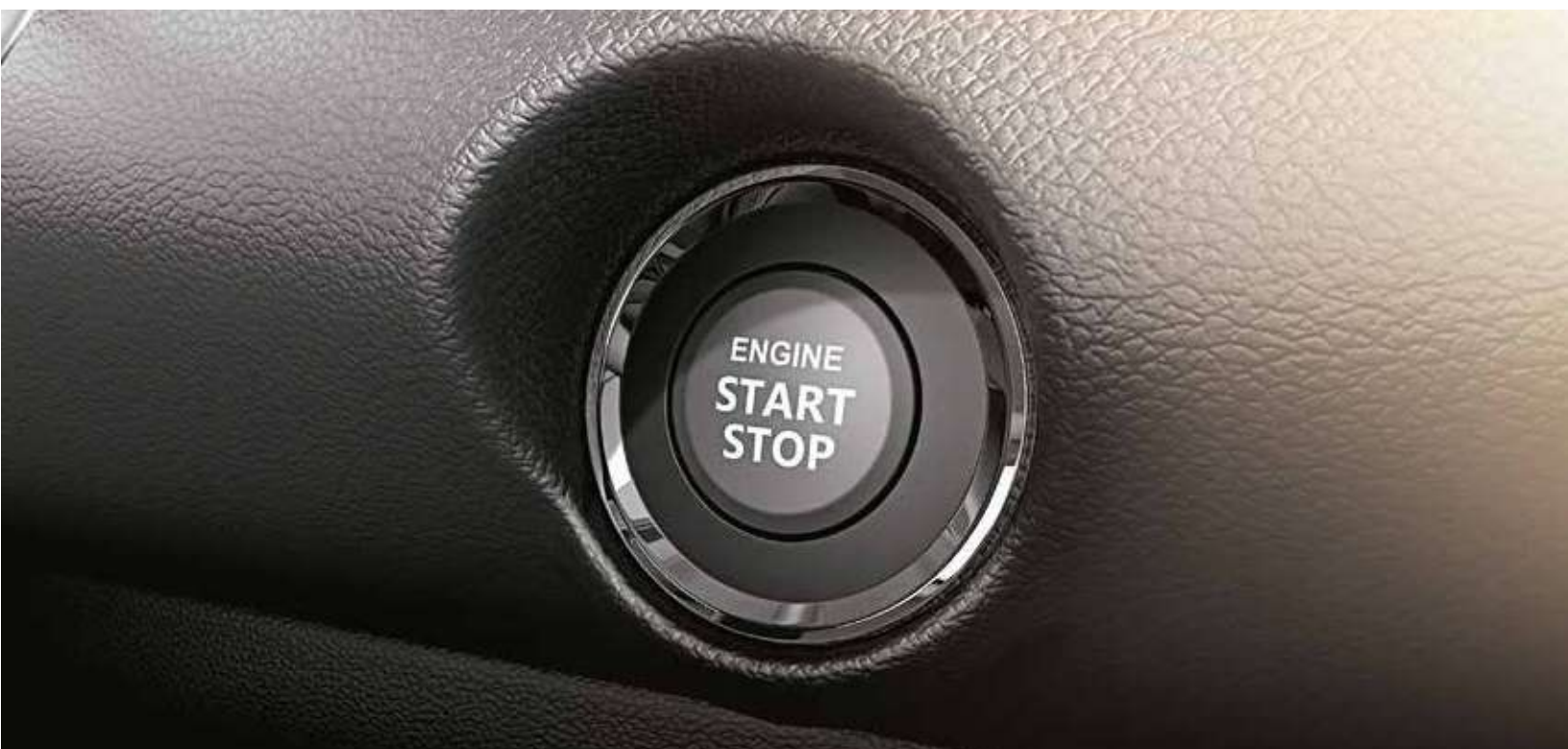
PUSH START-STOP BUTTON