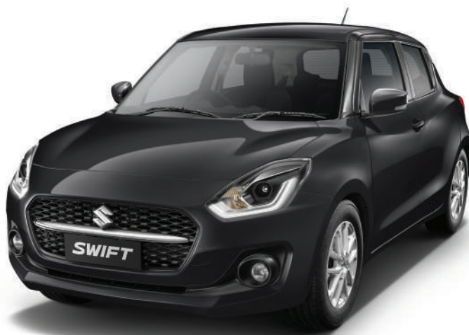
PEARL MIDNIGHT BLACK