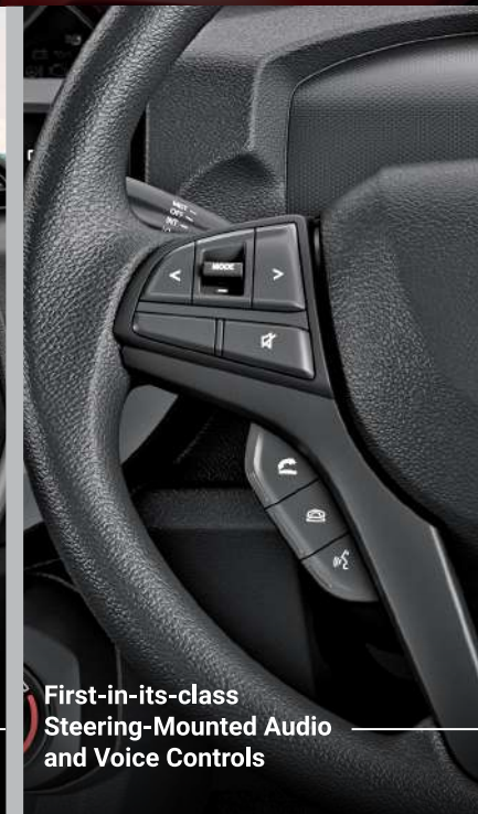
First-in-its-class Steering-Mounted Audio and Voice Controls