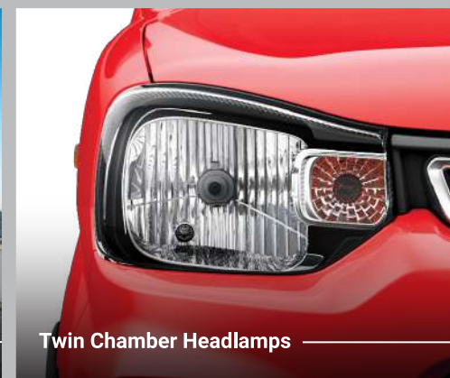
Twin Chamber Headlamps