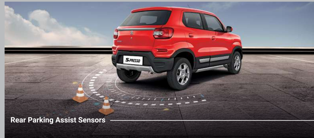
Rear Parking Assist Sensors