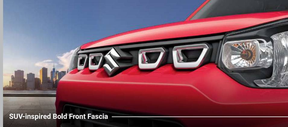
SUV-inspired Bold Front Fascia

How do you turn the everyday into something interesting? Simple. By adding passion, enthusiasm and little touches of surprise. That's exactly what you'll find in the Maruti Suzuki S-PRESSO . Slide in behind the wheel of this mini-SUV and make the world look up, as you accelerate through a journey of spirited living. Excitement, after all, is not a feeling, but an experience. So, live up the drive like never before.