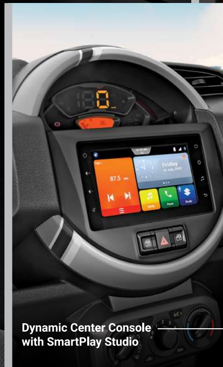
Dynamic Center Console with SmartPlay Studio