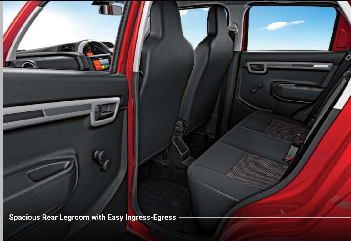
Spacious Rear Legroom with Easy Ingress-Egress