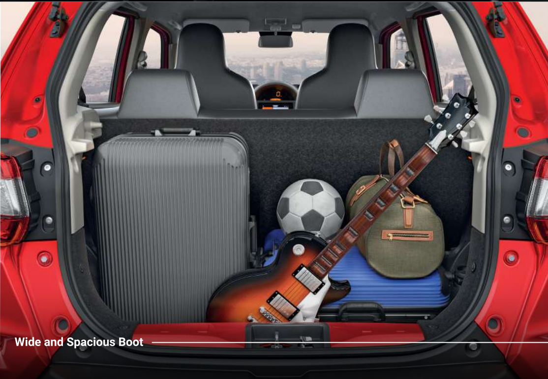
Wide and Spacious Boot

Open the doors and the S-PRESSO simply invites you to a world of never-ending excitement. All thanks to the commanding high-view seating that lets you scope the fun around you. Plus, its Dynamic Center Console, first-in-its-class Steering-Mounted Audio and Voice Controls and swanky colour accents make you feel alive, even before you drive out.