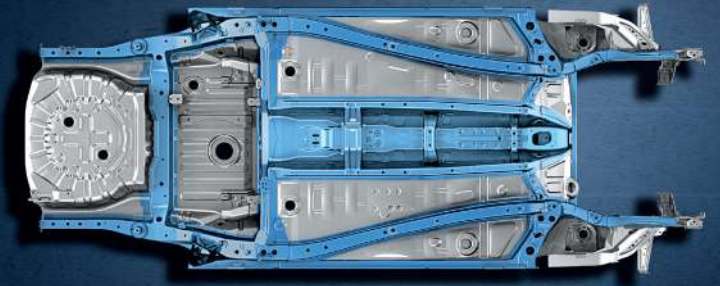
Strong Heartect Platform